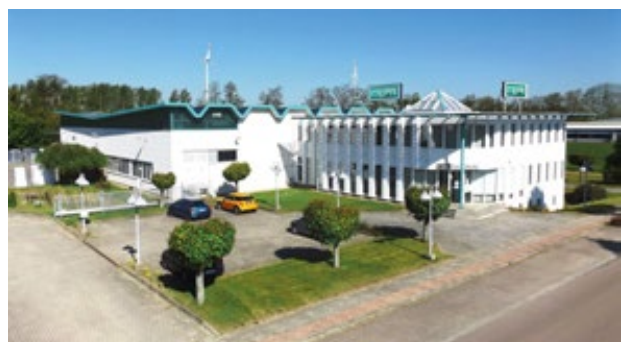
Subsidiary plant Pegau near Leipzig