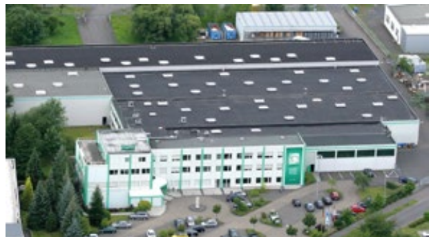
Main plant Rheinbreitbach